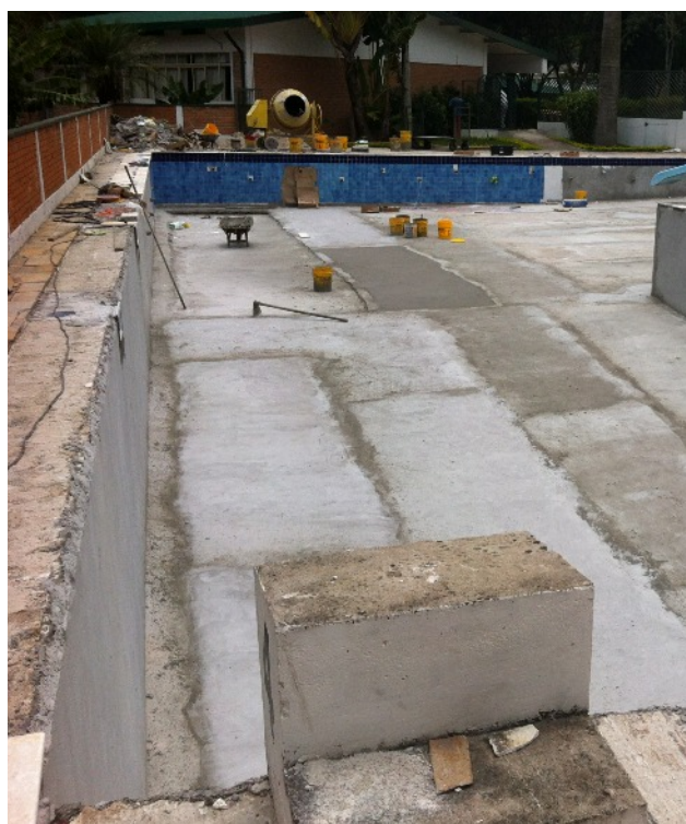
Photo taken on December 19, 2014. Tiles are being placed.