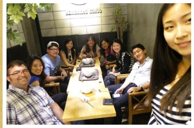
Catching up with former teachers and alumni in Korea.

Next semester, we will have more visits and the Linden College fair. We will keep our community posted about these important visits.